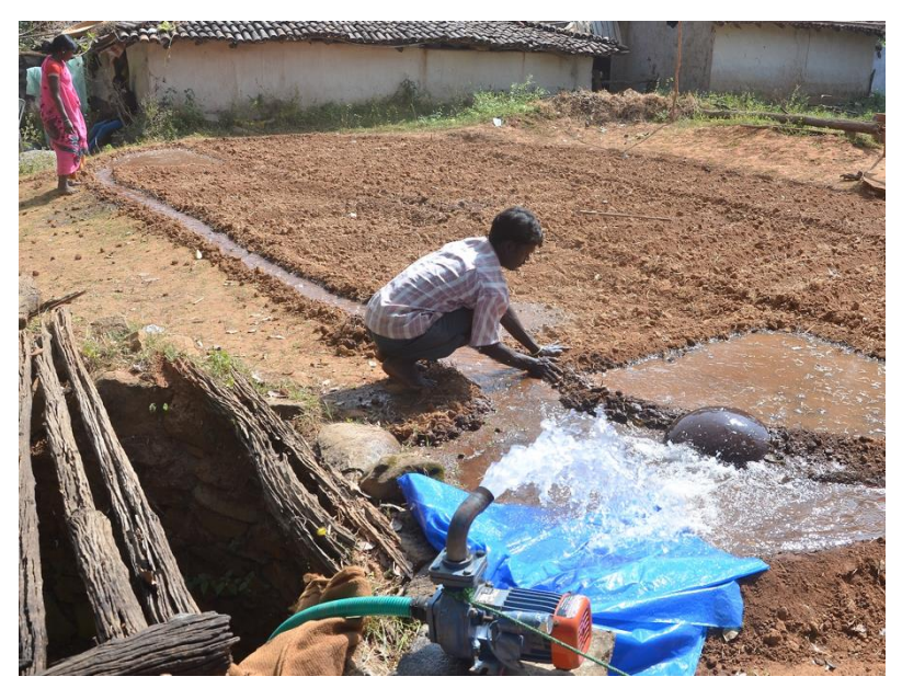
Farmers can now irrigate their fields with electric powered pumps

To improve their access to irrigation, Mlinda supports farmers in three ways. First, Mlinda connects the village in which it operates to irrigation sources such as reservoirs or canals. Second, Mlinda establishes ties with vetted suppliers of efficient pumps and offers farmers credit to purchase electric pumps, if required. Third, Mlinda has established a pump borrowing system. Mlinda loans pumps to farmers (at no additional costs), and farmers simply pay the incurred energy costs for running the electrical pump.<sup>6</sup> These arrangements benefit both partiesfarmers receive access to efficient electric pumps to irrigate crops and boost agricultural productivity. At the same time, Mlinda secures a reliable daytime energy load when the cost of electricity generation is low.