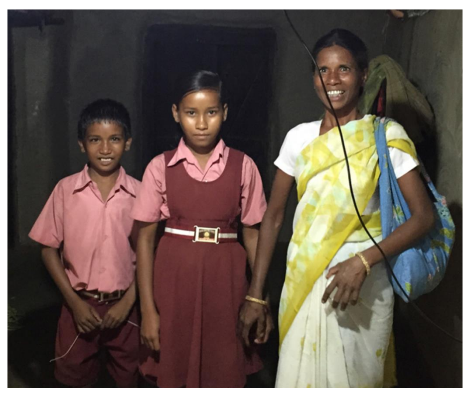
Reliable lighting is provided for a household in Jharkhand, India through solar mini-grid power

Solution: To qualify as a private provider, Mlinda has sought only private funding.<sup>40</sup> Therefore, it can charge a tariff above the India national grid prices.<sup>41</sup> The current daytime tariff is around ₹22 ($0.32)/kWh, and the nighttime tariff is around ₹44 ($0.64)/kWh.<sup>42</sup> The price disparity between day and