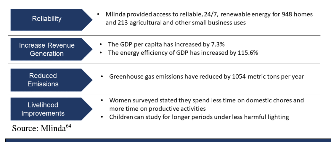
Figure 3: Mlinda's Livelihood Impact Summary (2018)