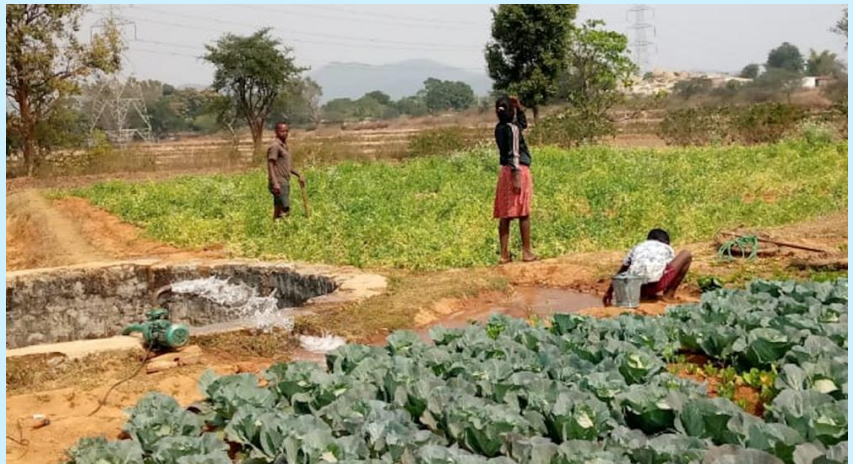
Sahtioli villagers irrigate fields with electric pumps powered by solar mini-grid