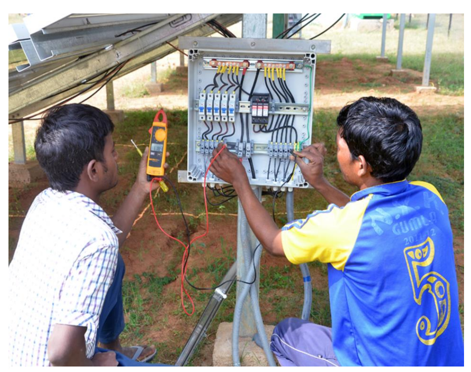
Mini-grid operator and engineer test the mini-grid power supply

Mlinda is continuing to expand its operations. In 2016, it was in a pilot phase with only two mini-grids deployed. As of January 2021, Mlinda manages 45 minigrids. Thus far, they have connected nearly 7,000 households to their community mini-grid network, providing electricity to 35,000-40,000 people.<sup>54</sup> In addition to managing and deploying mini-grids, Mlinda has an ancillary business that runs community mustard oil expeller operations. Through this work, Mlinda has created market linkages for communities' mustard oil.