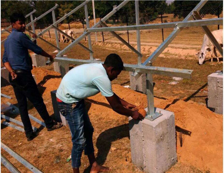
Local workers installing the framing for photovoltaic (PV) solar panels

Finally, Mlinda has a development team dedicated to working with communities to support micro-enterprises. The in-country team develops tailored strategies, such as connection to markets, regionally specific skills training, and productive use appliance financing to power local economies.<sup>27</sup>