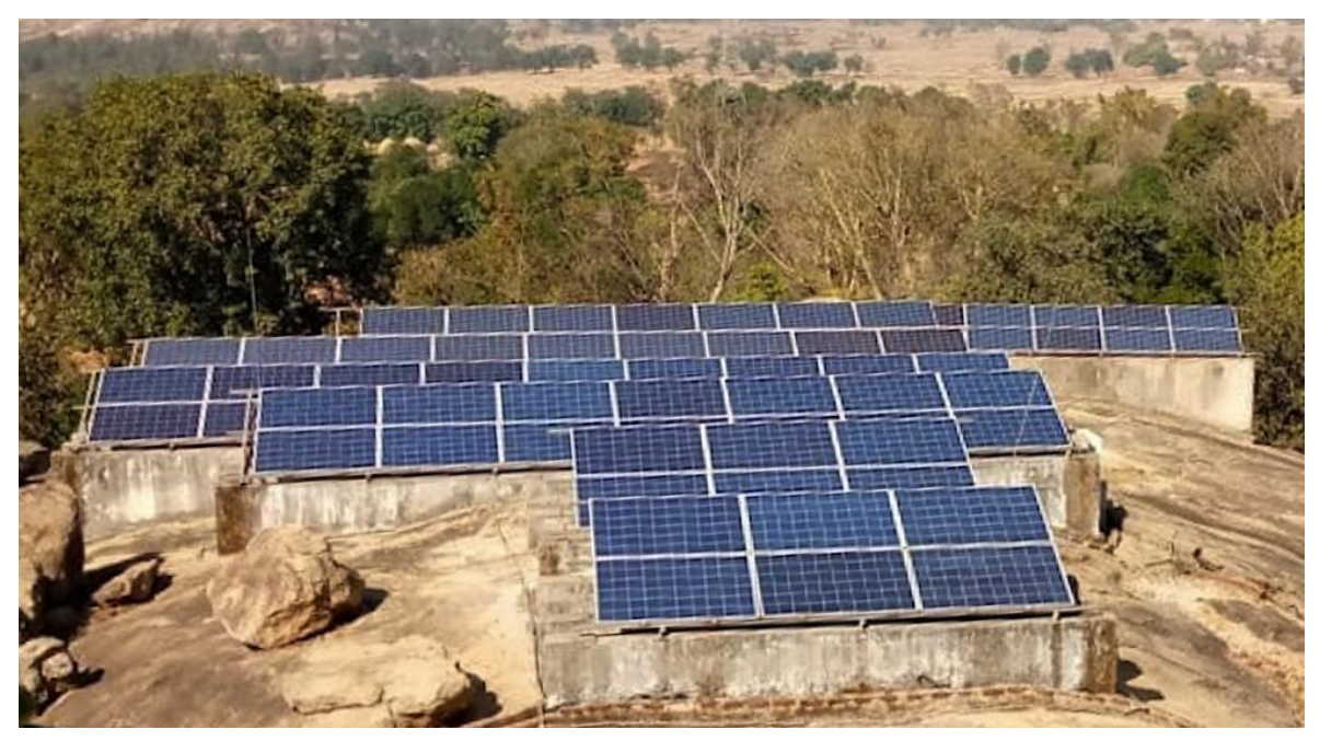
Community mini-grid installed in Sahtioli village

Over the years, Mlinda has developed strong ties with JREDA.<sup>49</sup> Mlinda serves as a complementary solution to grid power in Jharkhand. They have been an instrumental stakeholder working with the Jharkhand State Electricity Regulatory Commission (JSERC) to establish and strengthen the Draft Mini-Grid Policy 2018 for Jharkhand.<sup>50</sup> This policy aims to offer clear regulatory guidelines for mini-grids to strengthen decentralized renewable energy growth opportunities in the state.<sup>51</sup> Uttar Pradesh enacted a similar policy in 2016. The Uttar Pradesh Mini-grid-Policy outlines a flexible tariff structure and identifies areas eligible for mini-grid development.<sup>52</sup> Since creating this policy, private mini-grid providers have been able to work in parallel with Uttar Pradesh Power Corporation Limited (UPPCL) to provide greater energy security in the state. Supportive regulatory policies outlining licensing procedures, tariff guidelines, and grid interconnection stipulations can reduce costs and scale mini-grids.<sup>53</sup>