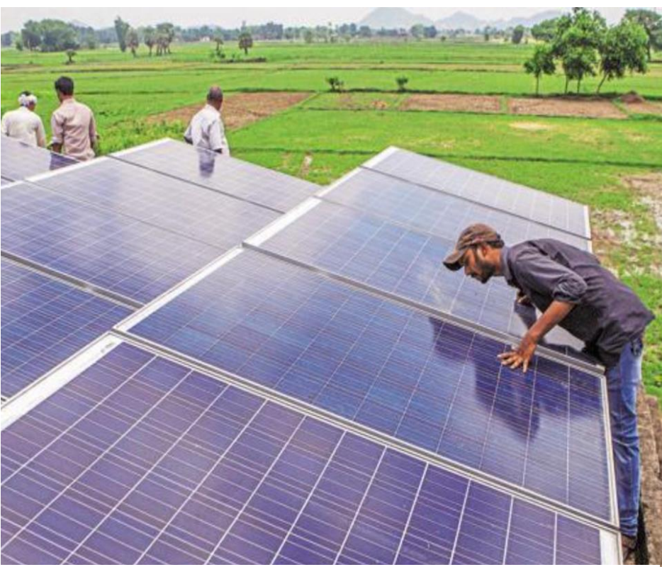
Solar mini-grids providers such as Mlinda and Smart Power India are expanding across India

Solar mini-grids offer a tremendous opportunity for job creation, especially if paired with skill development, connection to markets, and affordable and longer tenure financing.