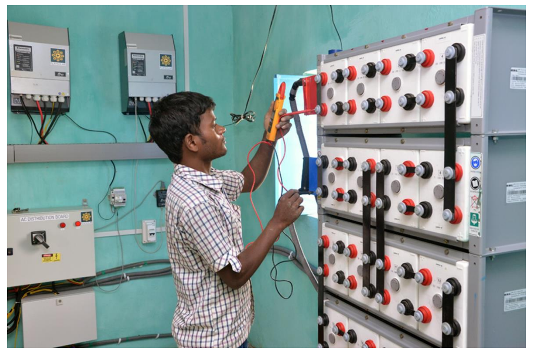
Mini-grid plant operator checks battery charge in mini-grid power house

TP Renewable Microgrid plans to deploy a "Utility-in-a-Box" modular mini-grid system that can be deployed and adopted to meet a community's energy demand. The mini-grid system comes pre-assembled with all hardware, which has enabled TP Renewable Microgrid to decrease their overall capital costs by 23% and reduce the installation time by 80%.<sup>77</sup> The company is focused on making its business model commercially viable and is looking to supply clean, abundant, and affordable electricity across rural India.