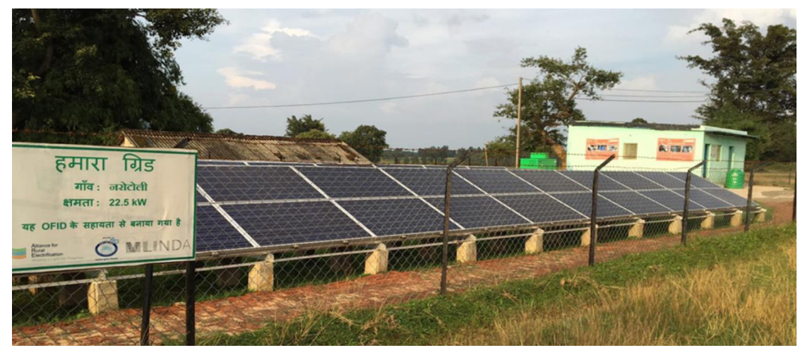
One of Mlinda's 45 modular solar mini-grids in Jharkhand, India

Electricity supply is vital but often insufficient to expand local economies, household incomes, and electricity demand.<sup>18</sup> Leading distributed renewable energy providers in India have adopted a more inclusive business model that focuses on services that extend beyond electricity supply. These providers have focused on building community capabilities by providing complementary services, such as extending credit to finance appliance purchases, running technical training and entrepreneurial skills programs, and creating market linkages for farmers and new entrepreneurs. Such initiatives have helped spur community development and have enabled these distributed renewable energy providers to secure reliable power demand and become self-sustaining. For this case-study, such a business model is called an "energy and development services" model.