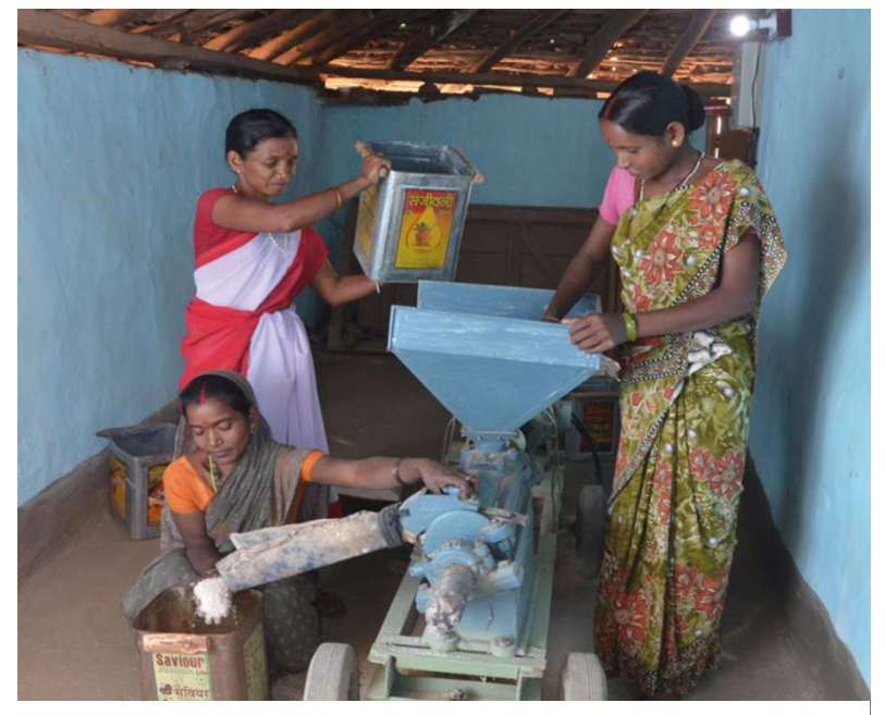
Solar mini-grid power provides electricity for grain milling

Access to affordable energy is vital to promote local economic growth and improve livelihoods. In 2017, the Indian government initiated the Saubhagya Yojana to prioritize universal access to electricity to all the willing households.<sup>6</sup> Through this program and other policies before it, an estimated 700 million people in India received electricity access between 2000 and 2018.<sup>7</sup> Despite the tremendous progress in electrification, energy poverty and the reliability and quality of energy supply remain critical issues.