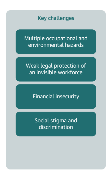
FIGURE ES.1. Key Challenges, Identified Good Practices, and Areas for Action

Sanitation workers range from permanent public or private employees with health benefits, pensions,